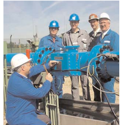
A member of the Bavarian Weights & Measures seals the ALTOSONIC V in Neustadt

The API guideline provides an independent reference for both buyers and sellers of high-quality multi-beam ultrasonic flowmeters. Such ultrasonic flowmeters combine accurate and reliable measurement with low maintenance and operating costs. They have no moving parts and are not subject to wear. Pressure drop is negligible, as there are no internals to cause flow obstruction.