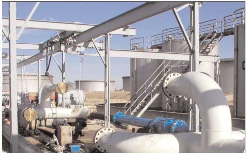
Test installation at SPSE

To demonstrate the stability of the ultrasonic flowmeters even at high flow rates, the meters were tested in a second calibration step using a specially designed master bench. This bench was installed in one of the TAL transfer stations. Basically, it consisted of 3 x 12 inch ultrasonic flow meters arranged in parallel runs and with a maximum flow rate of 2,500 m 3 /h. Each meter had previously been calibrated on the SPSE test rig. This arrangement was able to verify the linearity of the 20 inch ultrasonic flow meters up to the maximum flow rate of 7,500 m 3 /h required in subsequent operation.