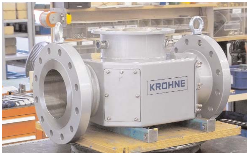
An ALTOSONIC V being prepared for a customer in Algeria

After clocking up 30 years of experience in the industry, KROHNE Oil & Gas now has a presence in all significant oil and gas markets: from Russia to the Far East, from Houston to Dubai. KROHNE Oil & Gas B.V., with its team of industry experts, is now the fastest growing company in the KROHNE stable. Thanks to its in-house capabilities, team of industry experts and cutting edge technology for level and flow measurement, KROHNE has managed to achieve outstanding successes and has won a series of major contracts in the oil and gas sector.